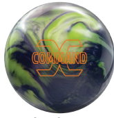
Columbia 300 Command