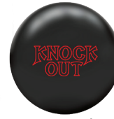
Brunswick Knock Out