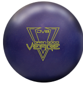
DV8 Damn Good Verge