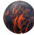
Black Widow 3.0