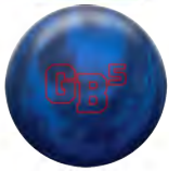
Game Breaker 5