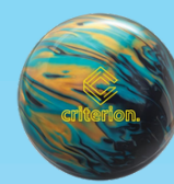
TRACK CRITERION HYBRID

*Ball cost is $125 only if you also compete in Adult-Junior. All others can purchase a ball for $180.