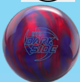
DV8 DARK SIDE