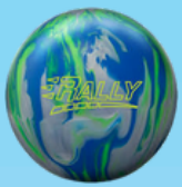
COLUMBIA 300 RALLY