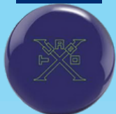
EBONITE TURBO X