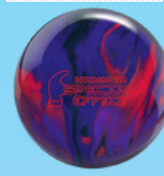
HAMMER SPECIAL EFFECT